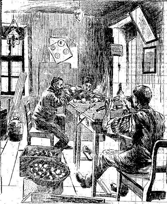
TOHEMIAN GLASS-BLOWERS MAKING

[ 1 2 3] [ 4 5 6 7 8 9 10 11 12 13 14 15 16 17 18 19 20 21 22 23 24 25 26 27 28 29 30 1